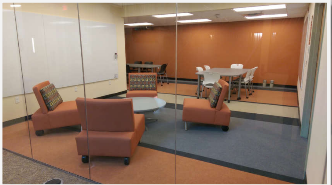
Fig. 1 Before Image

Fig. 2 After—Forbo Flotex floor tile installation completed on 1-10-17. Designed by Lorin Starr Interiors.